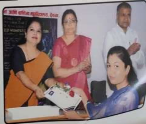
आंतरराष्ट्रीय महिला दिन समारंभ प्रमुख अतिथी महिलांचा सत्कार करताना