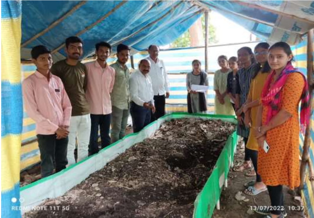
Staff and Students visiting the Vermicompost Unit.