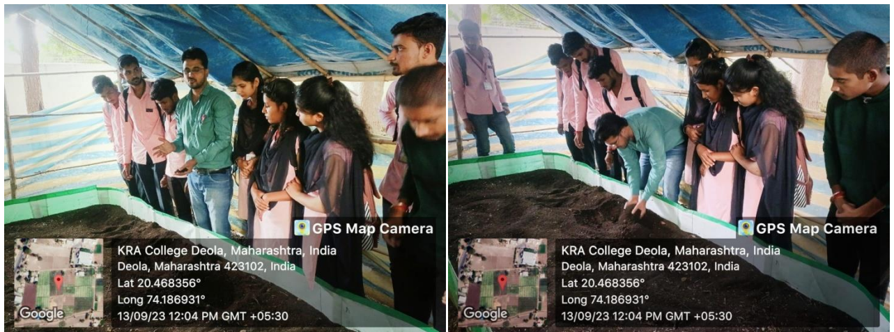
Staff and Students visiting the Vermicompost Unit.